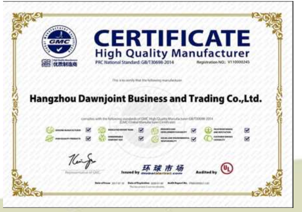
10+ Years Gold Supplier . OEM & ODM Service